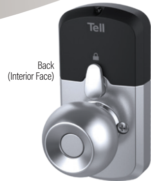
Back (Interior Face)