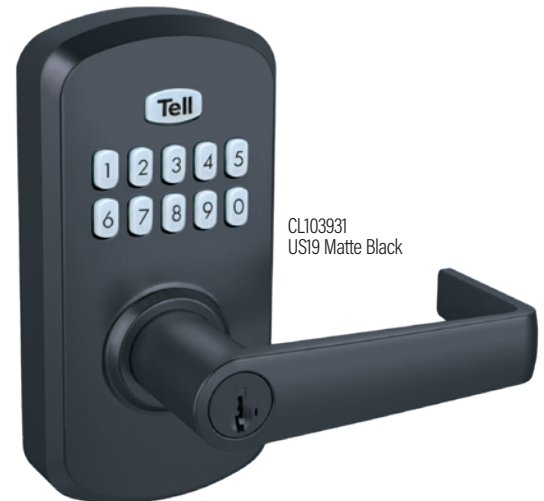
CL103931 US19 Matte Black