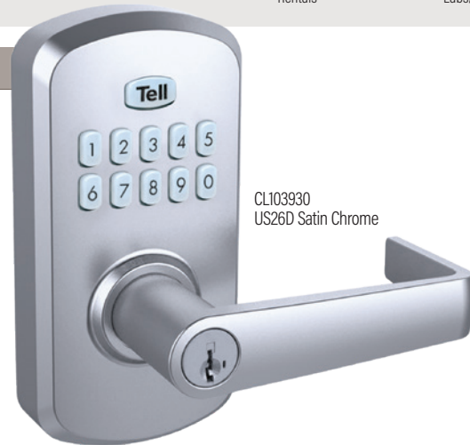
CL103930 US26D Satin Chrome