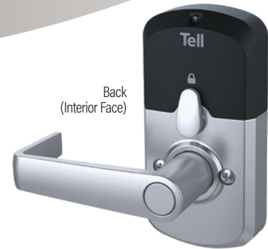
Back (Interior Face)